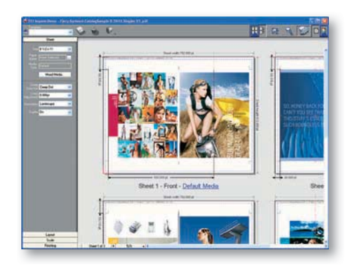
Optional EFI Impose streamlines and automates the imposition process, making production more efficient.